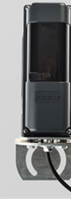
PHOTO EYE INCLUDED